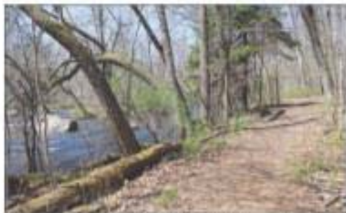
This segment of the River Ridge Trail runs along the Waupaca River, by Brainards Bridge Park.

ball diamonds, soccer fields and the like," she said.