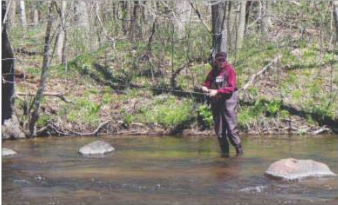
The Waupaca River is popular for fishing, including this segment by Brainards Bridge Park.

THURSDAY, MAY 7, 2020 | $1.50 | Volume 176