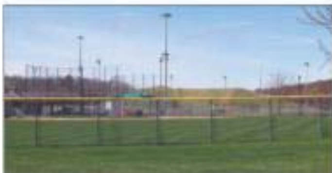
Swan Park includes ball fields, a sled hill and also a playground, area for skateboarding and access to the River Ridge Trail.

"The needs are looked at in terms of are there enough parks to serve the population now and in the future, and also amenities per trends of the community such as base-