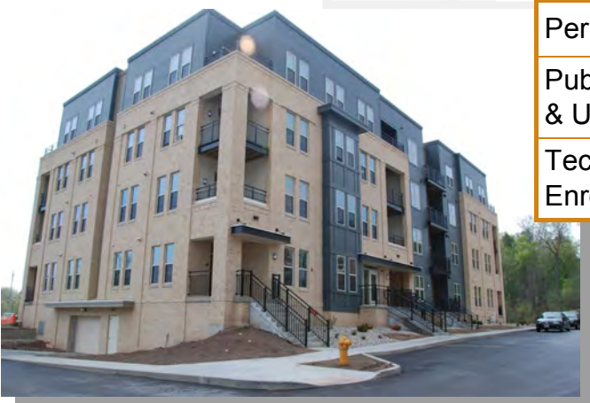
Photo: The Landing Redevelopment, Appleton

For more information on these and other indicators, please go to: http://www.eastcentralrpc.org/planning/economic/EDD/2013%20CEDS_Final%20reduced.pdf