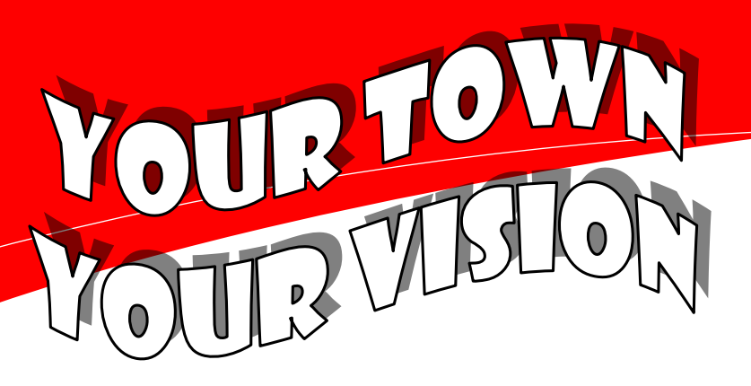
What is your vision for the Town of Byron in 2040? Are you part of it?