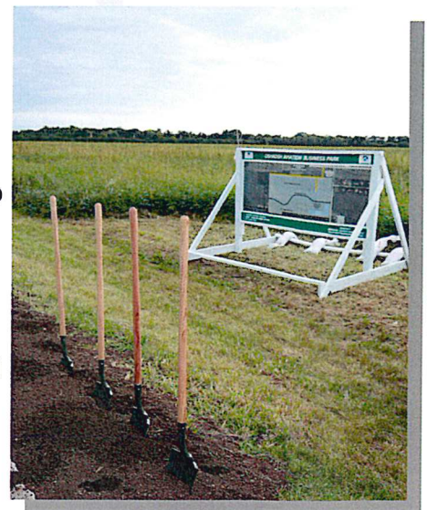
Photo: Aviation Business Park, City of Oshkosh

The Oshkosh Aviation Business Park would provide much needed space for expansion in aviation related business and have direct taxi-way access. It is expected to create an estimated 236 direct jobs over a ten year period which in turn will spur over $73 M annually in additional economic activity in Winnebago County.