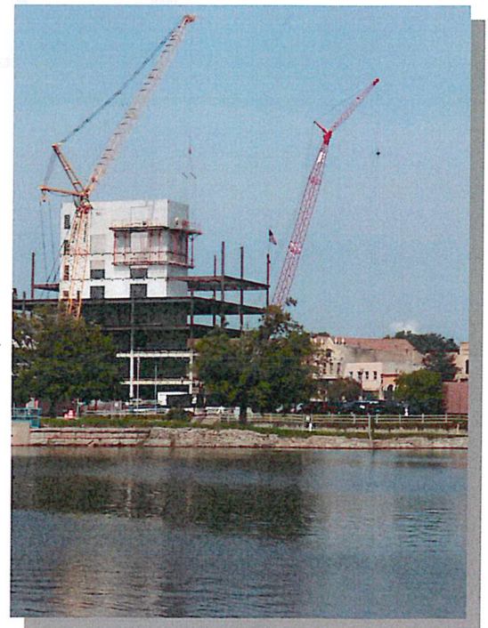
New Office Tower, City of Menasha