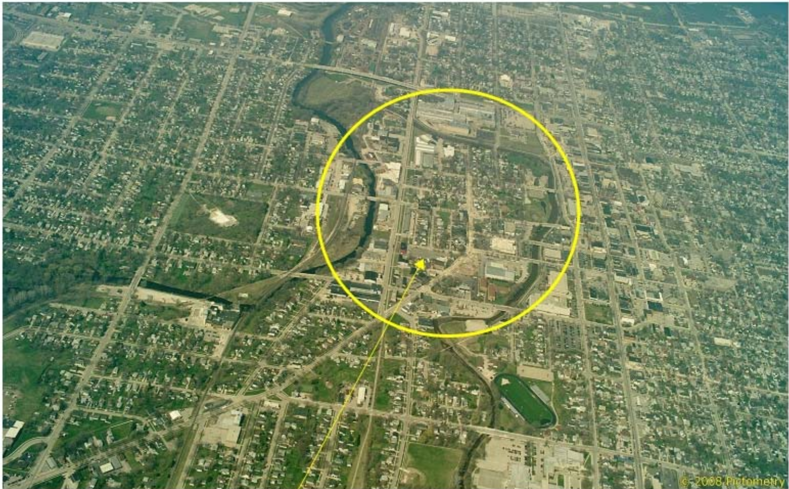
GENERAL AREA OF HAND NEIGHBORHOOD